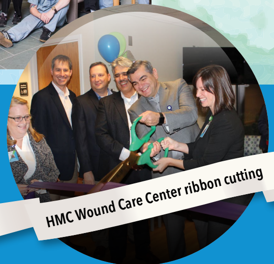
HMC Wound Care Center ribbon cutting